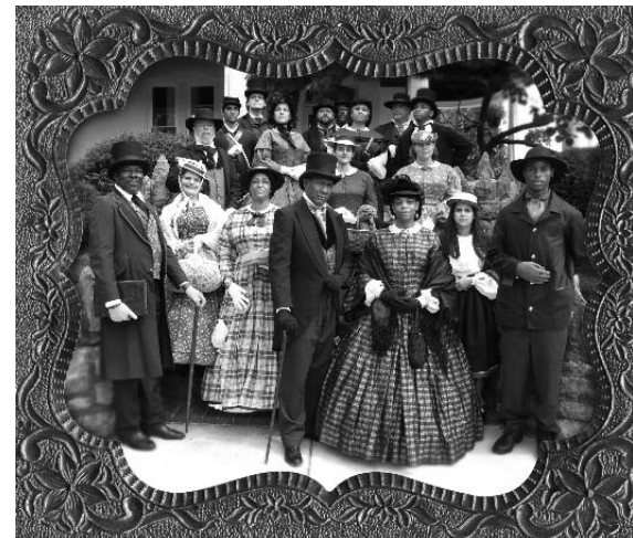
Shake hands with history! Look for the Pennsylvania Past Players along the trails.